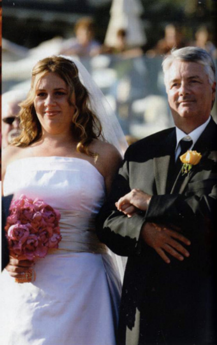
The blue waters of the Pacific Ocean provided striking contrast to the pink and orange flowers and rose petals.